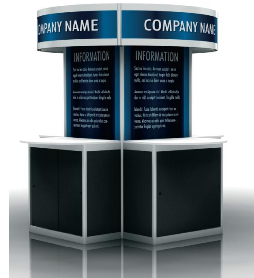
Exhibitor Demo Stations